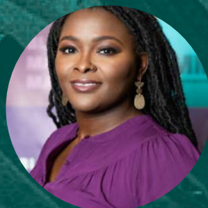
MAKINA TABLE, MPH CONSULTANT